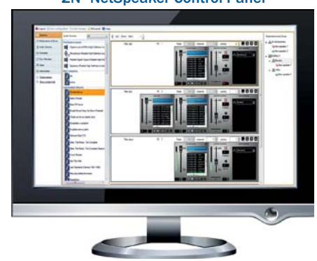
2N® NetSpeaker Console